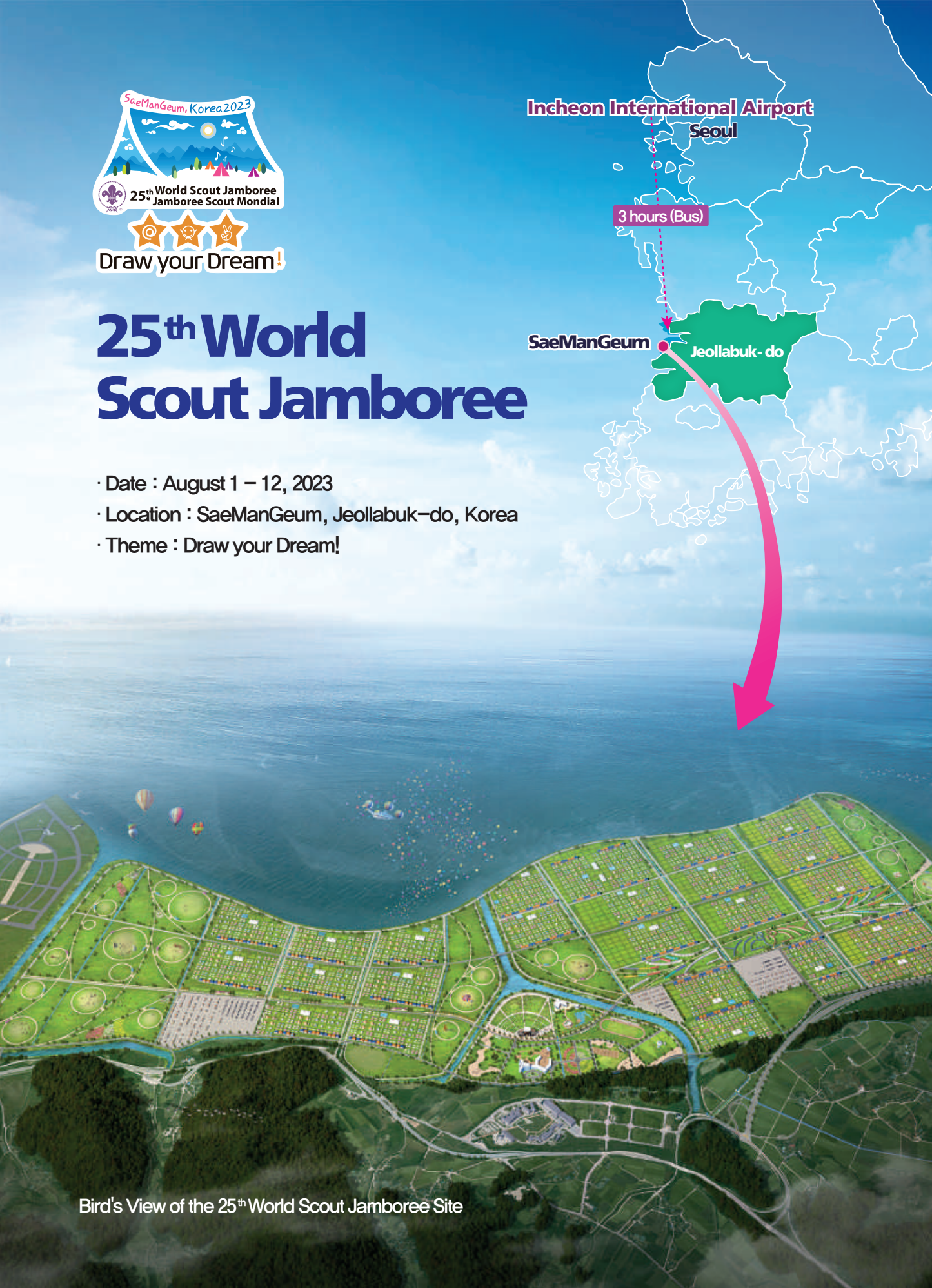
Bird's View of the 25 th World Scout Jamboree Site